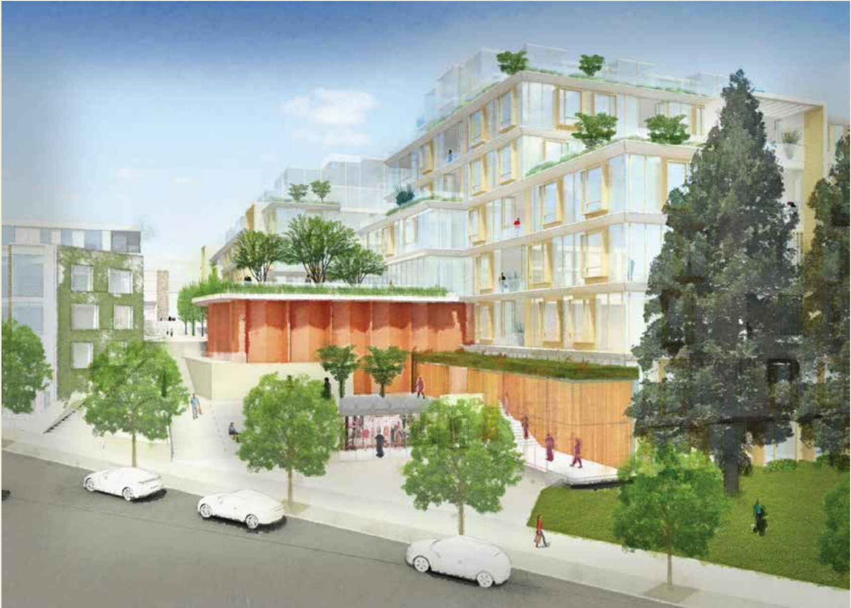
VIEW OF THEATER PLAZA.