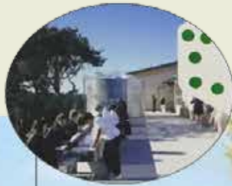
Rainwater Harvesting Reduced Runoff