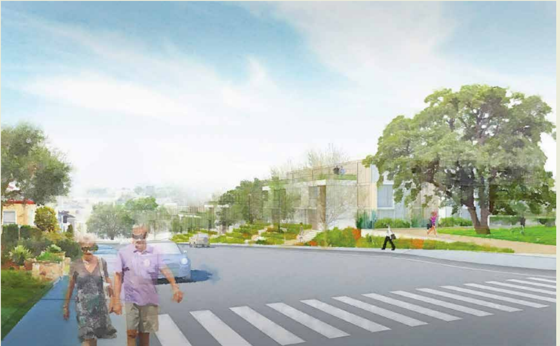
VIEW OF LAUREL & EUCLID.