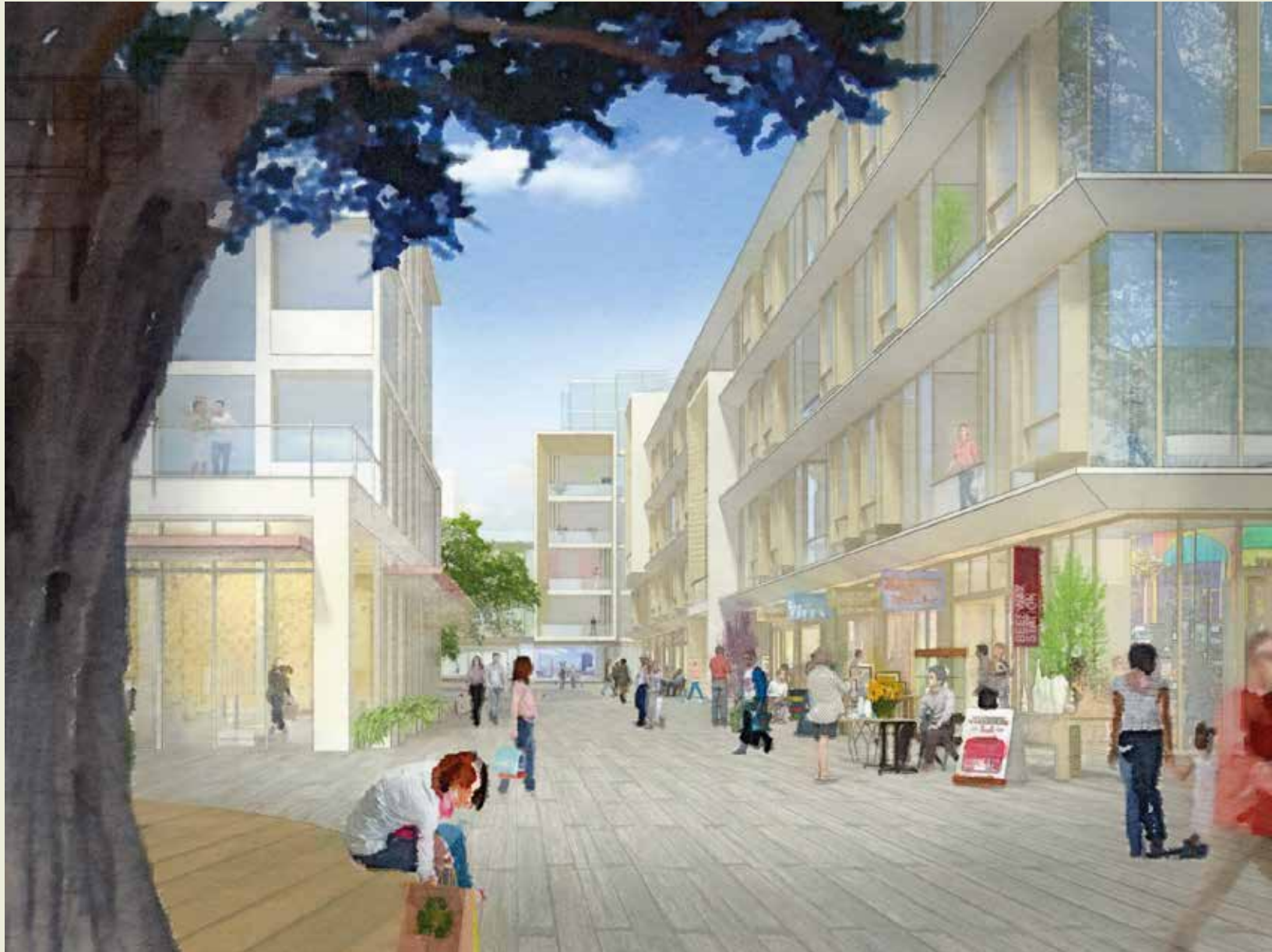
VIEW OF PEDESTRIAN PROMENADE.