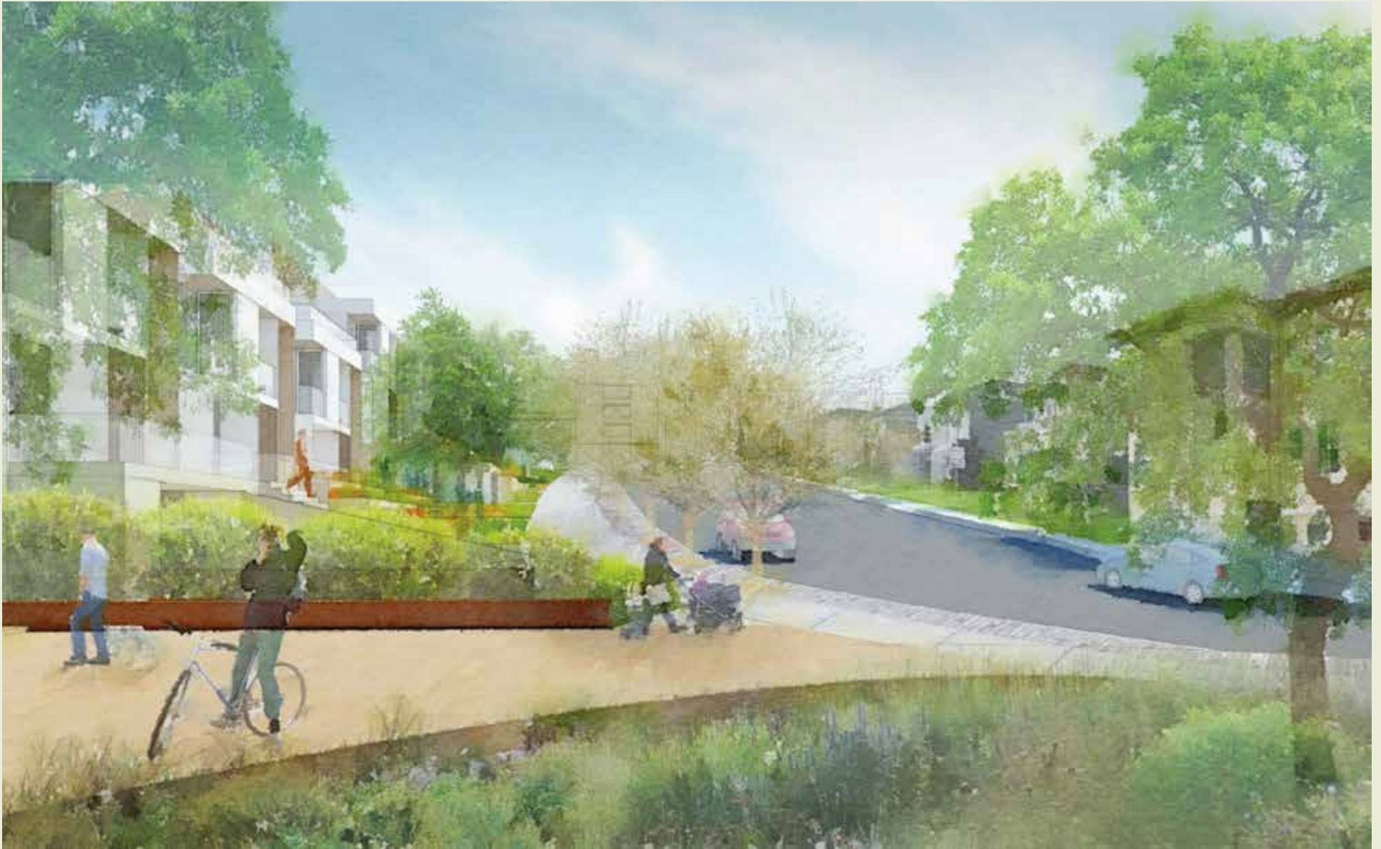
VIEW OF LAUREL STREET.