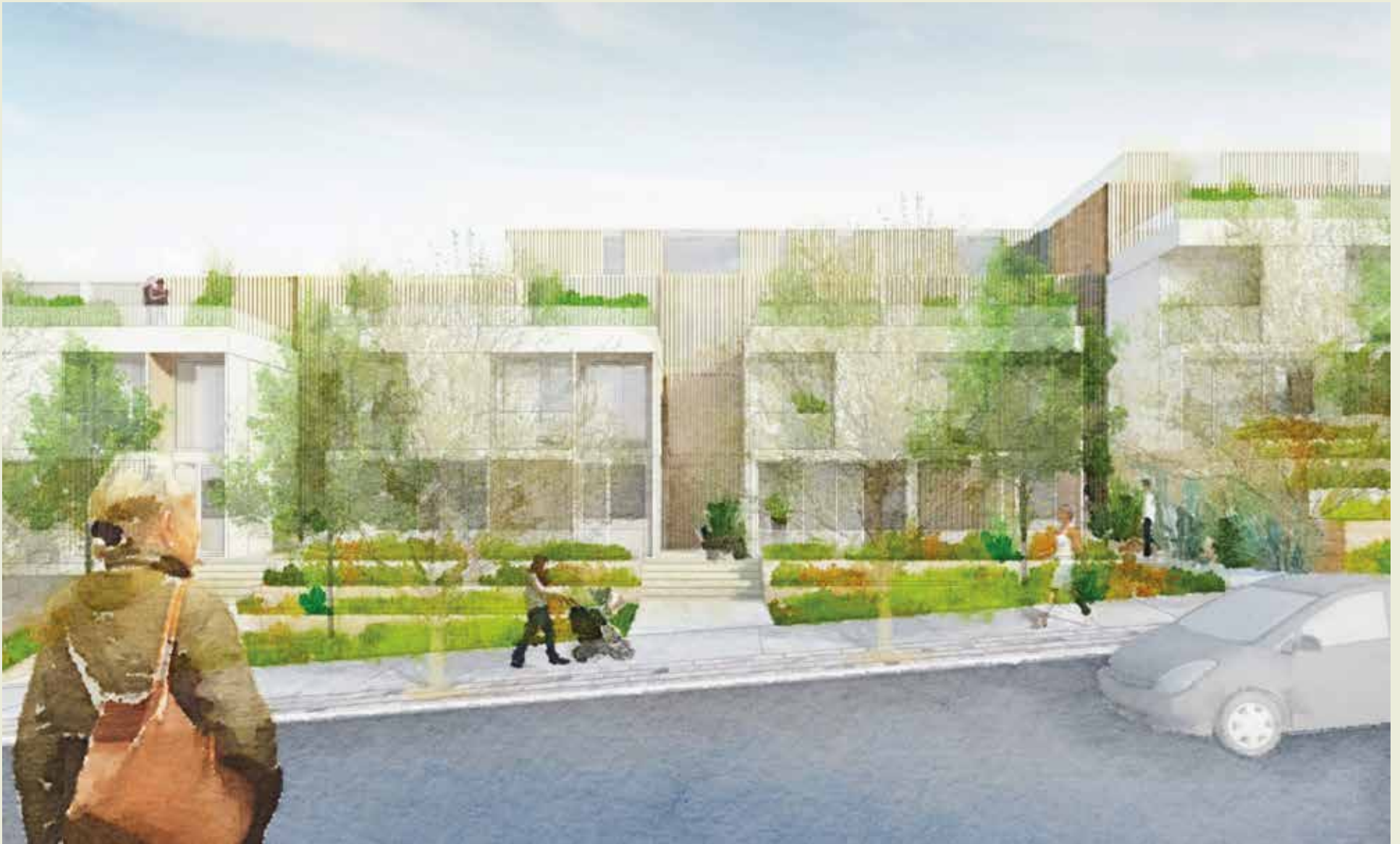
VIEW OF LAUREL HOMES.